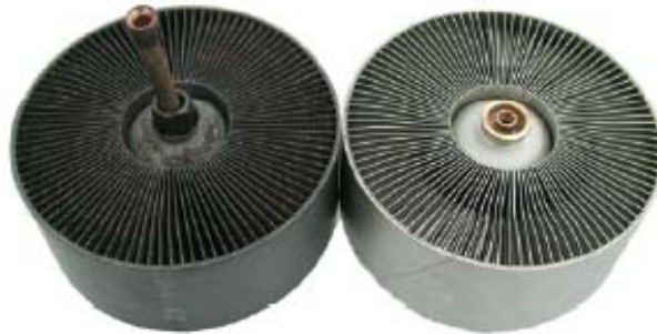
Figure 2. Improper cooling means short life. Discoloration of metal around the anode fins (left) indicates poor cooling or improper operation of the tube. A properly cooled and operated tube (right) shows no discoloration after many hours of use (note that some tarnishing of the plating may occur however).

be limited to 200°C at the lower anode seal under worst-case operating conditions. As tube element temperatures rise beyond 200°C, the release of contaminants locked in the materials used in manufacturing increase rapidly. These contaminants cause rapid depletion of the tungsten carbide layer