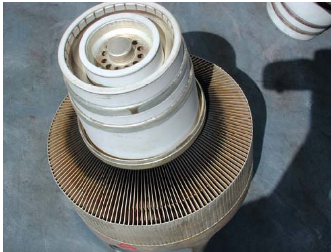
Figure 5 This tube shows evidence of being well mounted in a socket for at least a year (note the marks on the contact ring from the finger stock). However, there is no discoloration of the stem and the anode fins have some discoloration (air flow could have been improved somewhat on this tube).