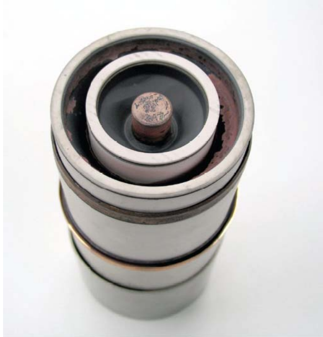
Figure 4 Water cooled tube with evidence of overheating. Note the severe discoloration in the tube stem. This tube will have a very short lifetime. Base cooling is of equal importance as anode cooling.